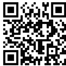
See Senva's Wet-Wet Products

Senva's PW31 stand-alone transducer achieves \pm 0.25\% accuracy at low DP ranges!